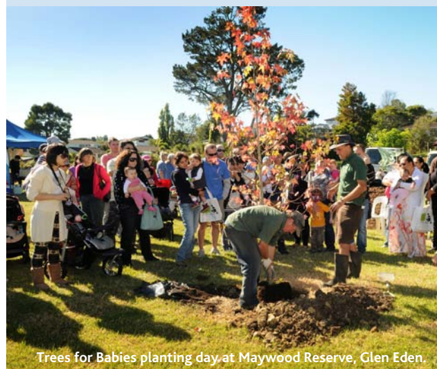
Trees for Babies planting day at Maywood Reserve, Glen Eden.

A "green day out" organised by Ecomatters Environmental Trust, Sustaining Our Streams and Keep Waitākere Beautiful Trust took place on Rahui Kahika reserve in Titirangi. The event turned the spotlight on the reserve and the fascinating bush and stream life that lives there in the head waters of the Avondale Stream. Around 100 volunteers took part in a weeding bee of the reserve's wetland, removing weeds which filled four super-sized weed bags. The Church of Jesus Christ of Latter Day Saints assisted, along with Local and Sports Parks West contractors which removed the rubbish from both clean-ups.