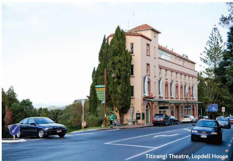
Titirangi Theatre, Lopdell House