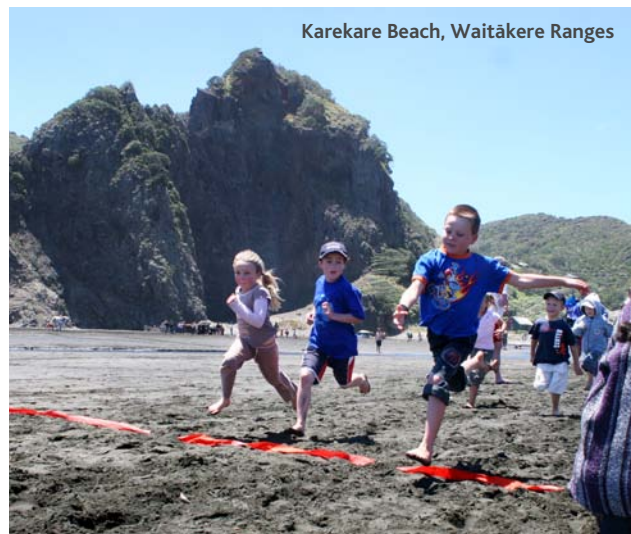
Karekare Beach, Waitākere Ranges

School travel plans are being developed for Waitākere Primary School to improve safety and accessibility in neighbouring streets in the vicinity of McEntee Road and Anzac Valley Road. Works being considered by Auckland Transport in conjunction with the school include a pedestrian access point and gateway treatment (reddish brown road surfacing and "slow" marking) at McEntee Road, a drop-off/pick-up zone at Anzac Valley Road, safety improvements at the intersection of Bethells Road and Anzac Valley Road, and gateway treatment to encourage slower vehicle speeds along Bethells Road and warn Waitākere Road motorists that a slower speed environment is ahead.