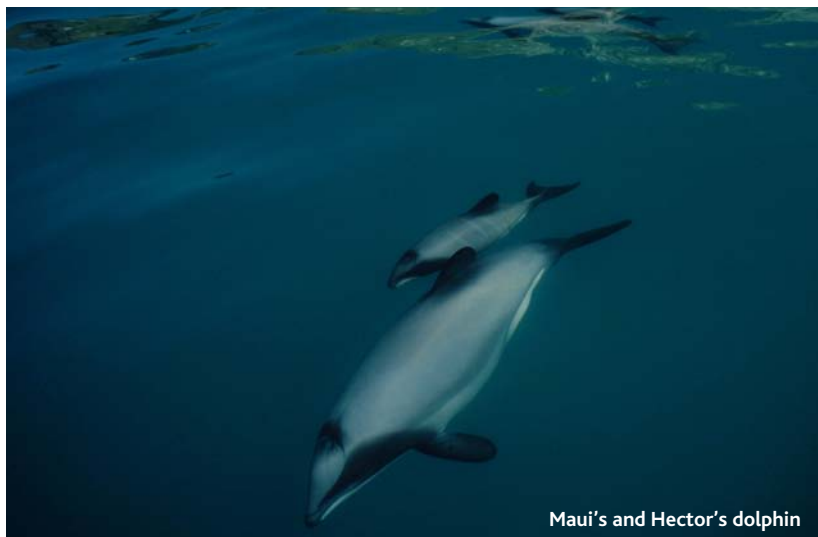
Maui's and Hector's dolphin

The plight of the endangered Maui's and Hector's dolphins has won the support of the Waitākere Ranges Local Board, which has made a submission in support of a Government initiative to extend their area of protection. The little dolphins are the world's smallest and rarest marine mammals and are found only in New Zealand. There is a dwindling population of around 7000 Hector's dolphins in the South Island and about 55 Maui's dolphins in the North Island. Their numbers have dropped dramatically since the introduction of gill and trawl netting with nylon filament nets.