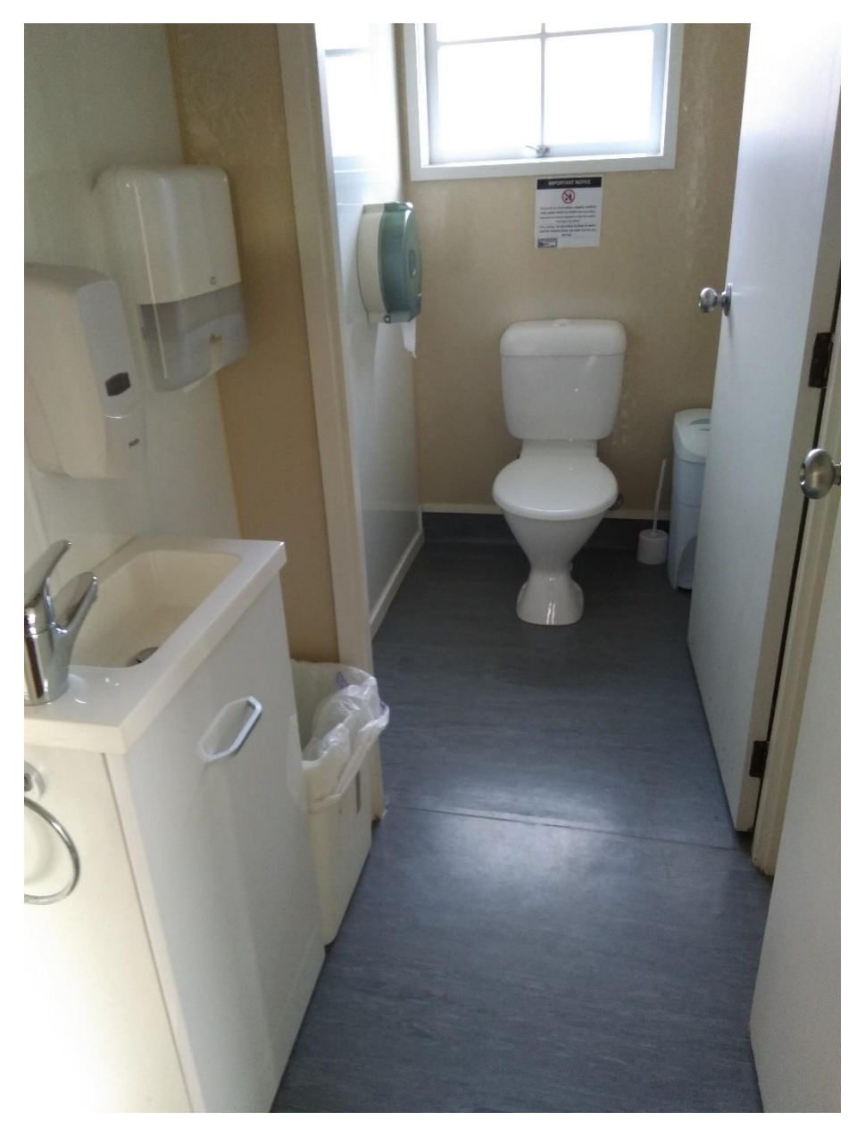
Two toilets with handbasins. Handtowels, toilet paper, hand soap supplied. Baby changing table Brooms, mops for cleaning up