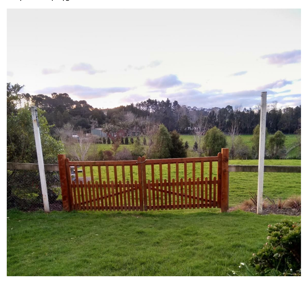
Gate leading from playground to Domain