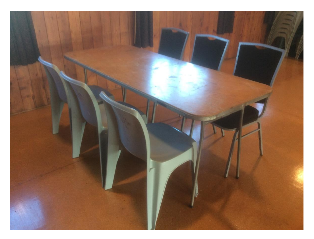
4 6-seater tables (pictured) and 1 8-seater table