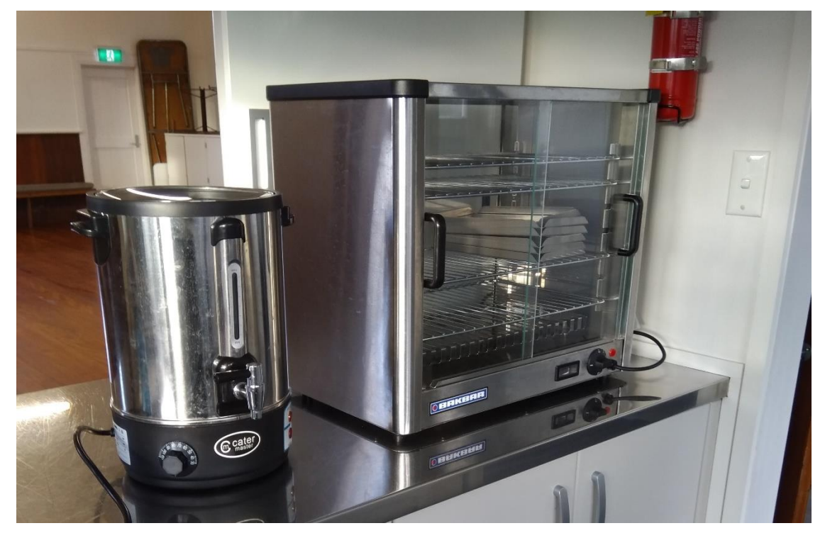
Kitchen with fridge, microwave, oven and stove top, HW urn, pie-warmer.

You need to provide your own catering and serving equipment and plastic bags for rubbish.